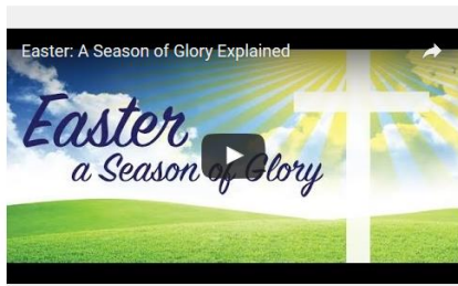
Easter: A Season of Glory Explained

Home > Being Catholic > Easter: A Season of Glory